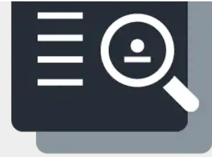
Casos de estudio