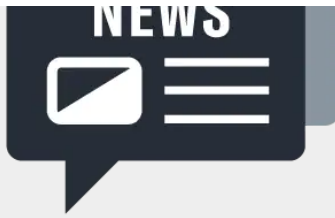
Noticias y eventos